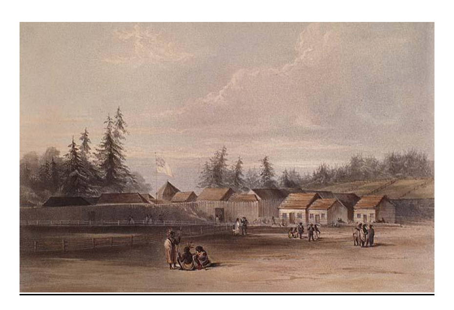
Fort Vancouver, by Henry James Warre, 1845, National Archives of Canada, c001628k.

The oldest and, in it's prime, by far the most important of the Hudson's Bay Company's coastal forts in the Pacific Northwest was Fort Vancouver. Established in 1824 about 100 miles from the coast on the north bank of the Columbia River near present day Portland, the Fort was built to replace Fort George which had been located on the south bank near the mouth of that River.